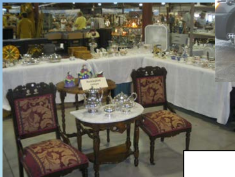
42 nd Annual Antique Show